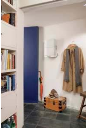
Moixa Smart Battery for the home.